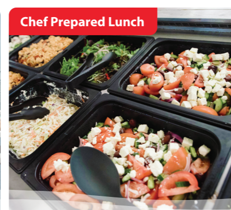
Chef Prepared Lunch