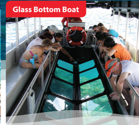
Glass Bottom Boat