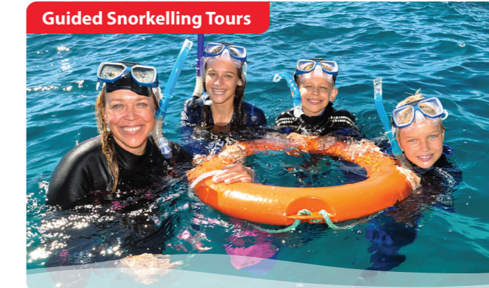
Guided Snorkelling Tours