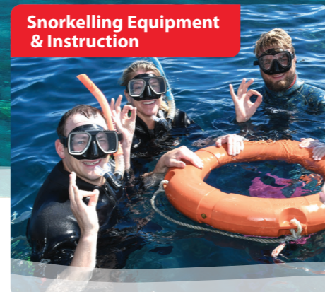
Snorkelling Equipment & Instruction